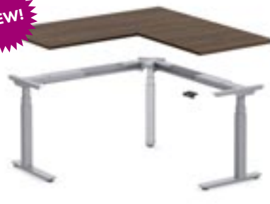
BEST (3-Stage): L-Shaped Electric Height Adjustable Base Model No. PLTECAB6078MEDWF