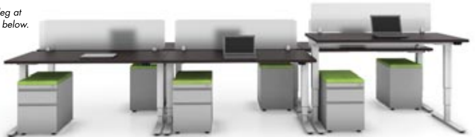
Workstation Shown: PLTEAB4872MEDNF(6), PLTBUDFEET30(6), PLT3060(6), PLTAP1554S(6), PLTSBUDMSGSL(6), CPPBF(6), PLCUSH1522(6), CPPCASTERS(6) List $17,442

PLEASE NOTE: Legs shown are incorrect. Wide part of leg at bottom, thin part at top. See example single workstation below.