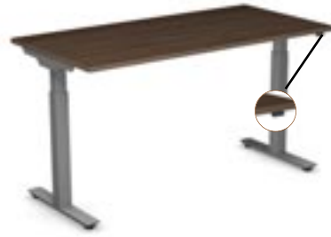
BETTER (2-Stage): Electric Height Adjustable Base