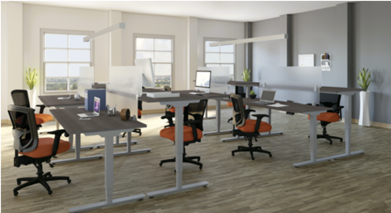
Workstation Shown: PLTEAB7248MEDNF(8), PLTBUDFEET30(8), PLT3072(8), PLTAP1554S(8), PLTSBUDMSGSL(8) List $18,656

PLEASE NOTE: Legs shown are incorrect. Wide part of leg at bottom, thin part at top. See example single workstation below.