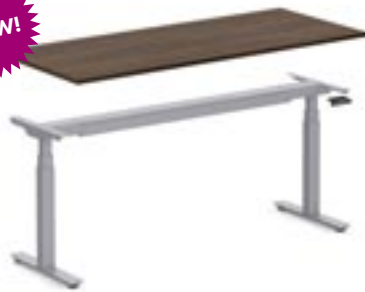
BEST (3-Stage): Electric Height Adjustable Base Model No. PLTEAB4872MEDNF, PLTBUDFEET24, or PLTBUDFEET30