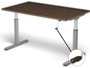
GOOD: Hand Crank Height Adjustable Base