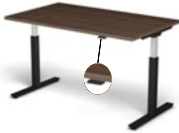
GOOD: Pneumatic Height Adjustable Base